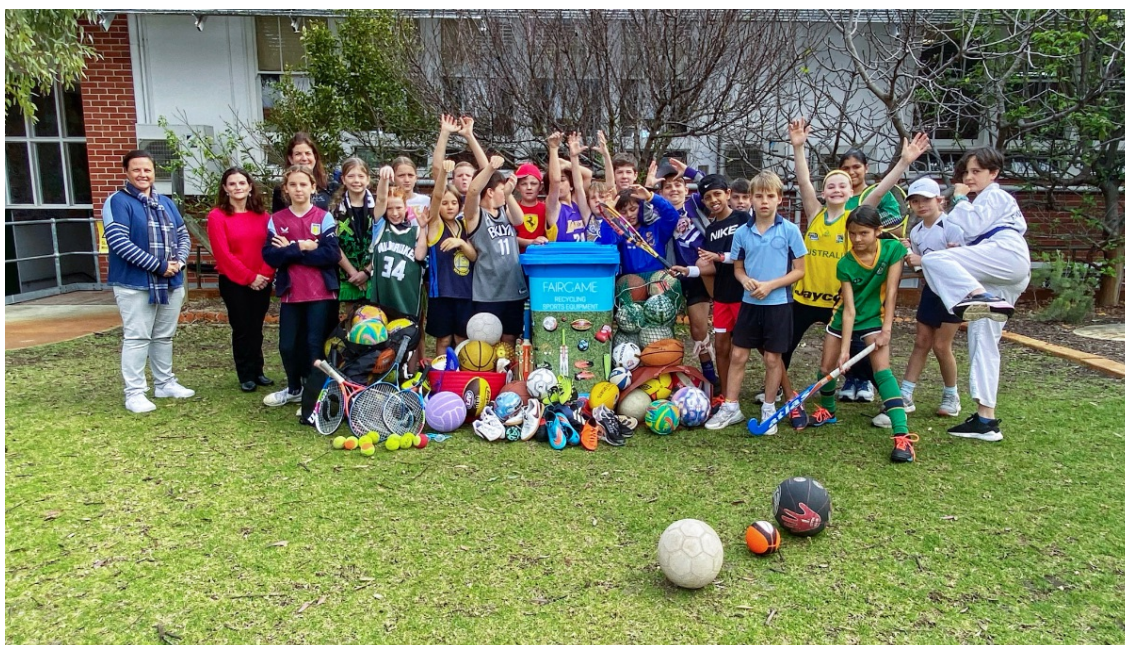
Floreat Park Primary School students had a blast hosting a Be A Sporting Hero free dress day in 2022

This is a great project for school leaders and we have a heap of helpful resources on our website, including a step by step guide for student organisers, posters to print and videos to share.