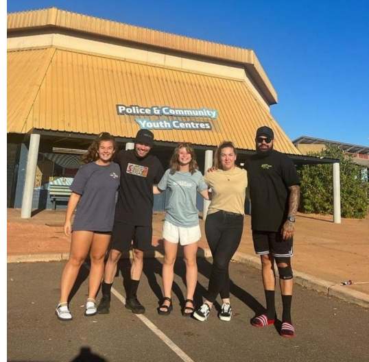
L: Dodgeball in Fitzroy Crossing (January, 2023)