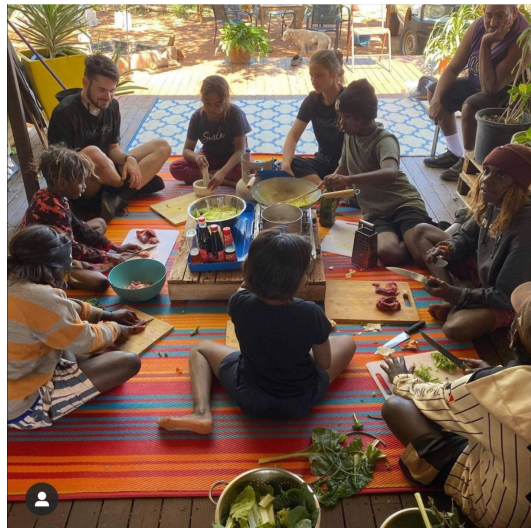
Ball games at Punmu (population 142) Making lunch at Warralong (population 179)