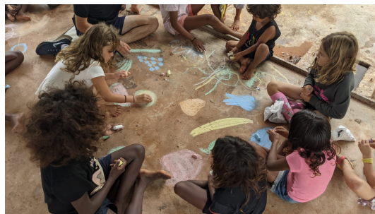
Game On! on the basketball court and Healthy Bellies activities in Kunawarritji.